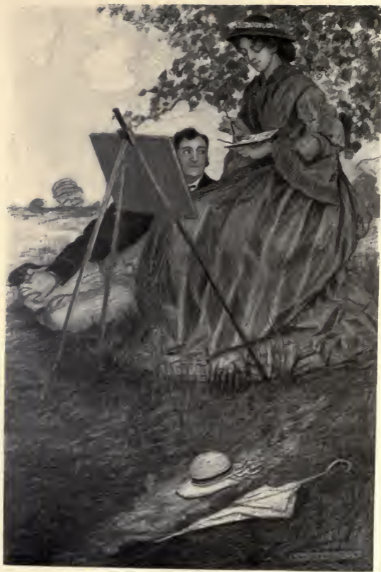
“‘IT IS LARGE FOR A SKETCH,’ SHE SAID.”